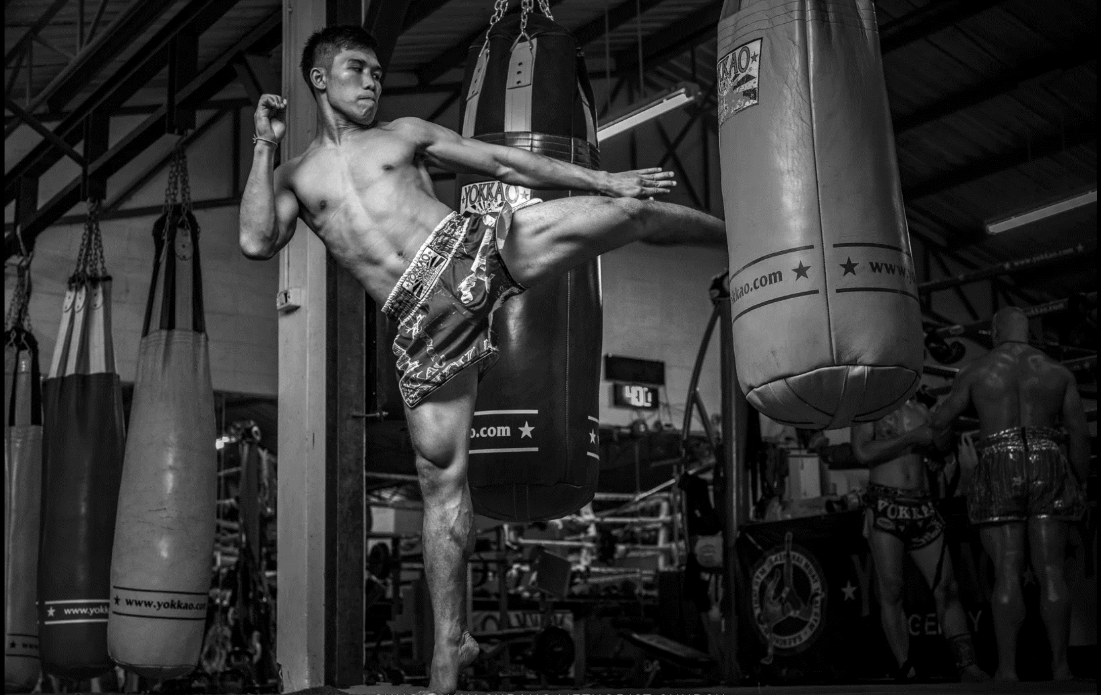
SUNGAT WAY-SUBANG METHODIST CHURCH